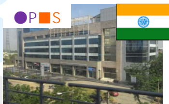
OMRON Automotive Components India Pvt, Ltd.