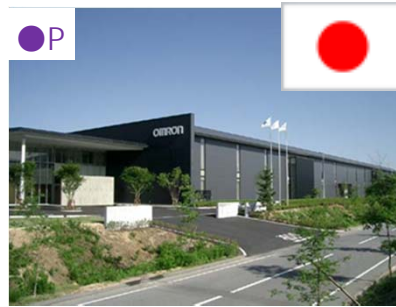
Iida Japan Office