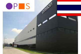
OMRON Automotive Electronics Co., Ltd.