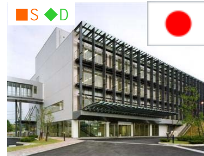
Komaki Japan Headquarter