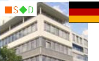
OMRON Automotive Electronics Europe GmbH