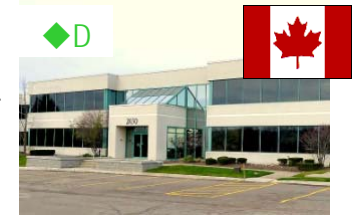
Omron Automotive Technologies, Inc.