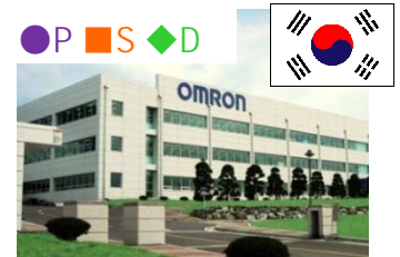
OMRON Automotive Electronics KOREA Co., Ltd.