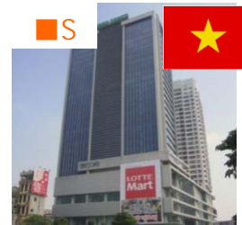
Omron Vietnam Co., Ltd.