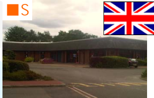
OMRON AUTOMOTIVE EUROPEAN SERVICE LTD.