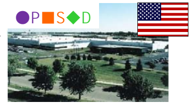
OMRON Automotive Electronics, Inc.