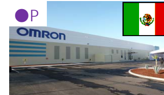
COMPONENTES ELECTRONICOS OEDS DE MEXICO