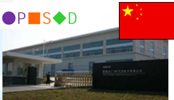
OMRON (Guangzhou) Automotive Electronics Co., Ltd.